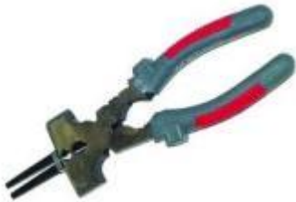
WMPP2210C MIG PLIERS $12