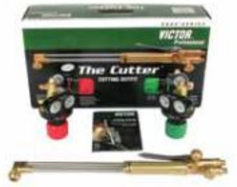
VICTOR ST2600FC CUTTER SELECT HEAVY DUTY CUTTING OUTFIT