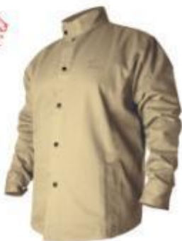
#BXTN9C KHAKI F/R COTTON