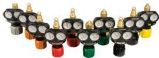
VICTOR EDGE PROFESSIONAL REGULATORS