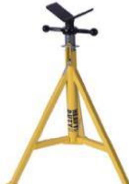
ST-802 ROLLER HEAD