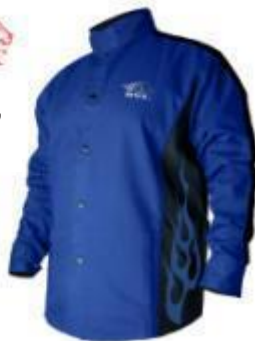
#BXR9C BLUE F/R COTTON