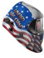
PATRIOTIC 07-0012-31 AP