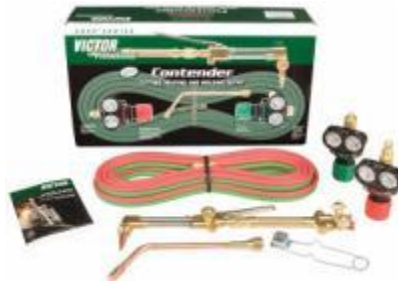
VICTOR CONTENDER CUTTING/HEATING OUTFIT