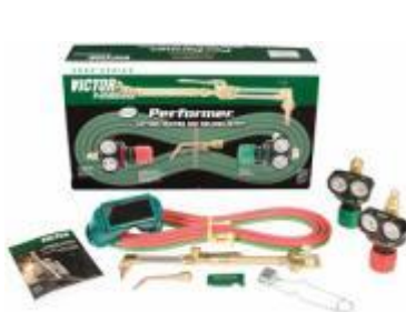
VICTOR PERFORMER CUTTING/HEATING OUTFIT