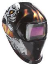
ACES HIGH 07-0012-31AH