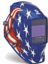
STARS & STRIPES