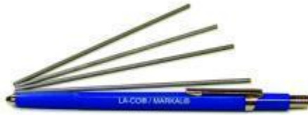
WMS230C WELDERS PENCIL W/ 4 REFILL $12