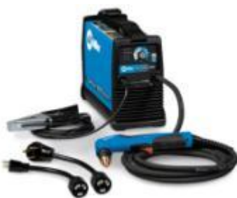
SPECTRUM 625 X-TREME

3/8" RATED CUT @ 14 IPM 115/230V DUAL VOLTAGE NEW XT30 12' TORCH # 907529 $1285