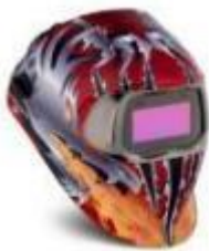
07-0012-31RD RAZOR DRAGON