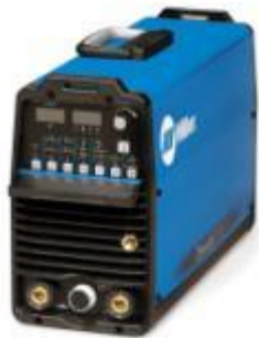
DYNASTY 200SD & 200DX