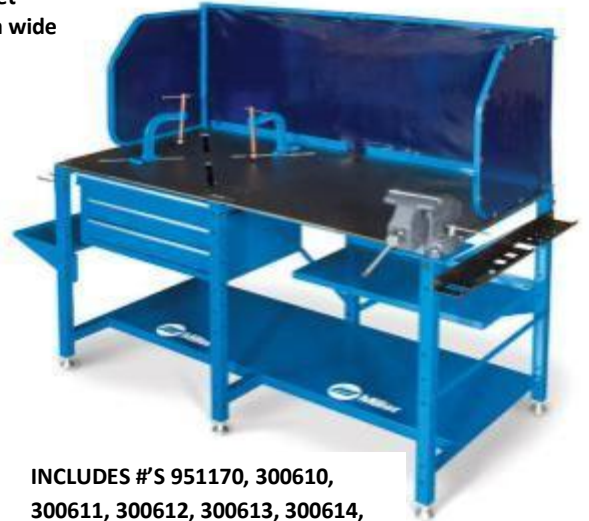
INCLUDES #'S 951170, 300610, 300611, 300612, 300613, 300614, 300679, 300680, 300686, 300850