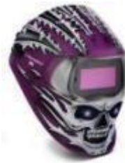
07-0012-31RS RAGING SKULL