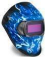
07-0012-31IH ICE HOT