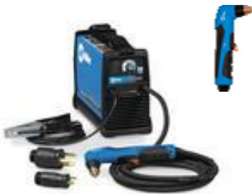
SPECTRUM 375 X-TREME

3/8" RATED CUT @ 14 IPM 115/230V DUAL VOLTAGE NEW XT30 12' TORCH # 907529 $1285