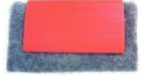
WM500 WIRE CLEAN PAD $9 (6PK)