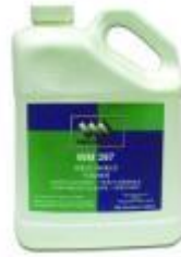
WM397 ANTI SPATTER $19