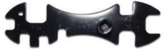
1013C 10-WAY TANK WRENCH $8