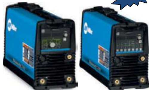
DYNASTY 280 & 280DX