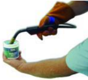
WM731 NOZZLE DIP $6