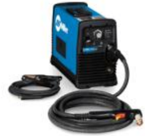
SPECTRUM 875 AUTO-LINE

7/8" RATED CUT @ 10 IPM 208/230 VOLTAGE SINGLE PHASE ONLY 20' TORCH #907390011 $2115