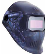
TROJAN WARRIOR 07-0012-31TW